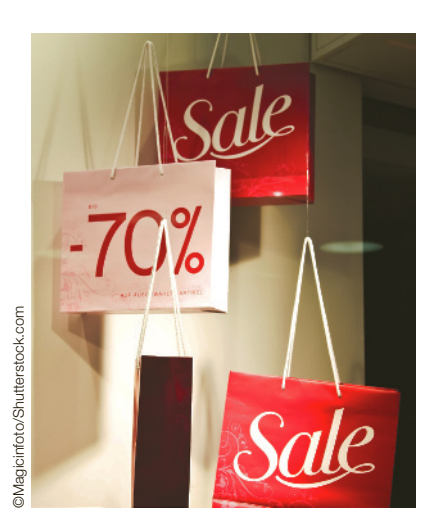
Because consumers respond to incentives, store owners know they can sell off excess inventory by reducing prices.

Marginal choices always involve the effects of net additions to or subtractions from current conditions. In fact, the word additional is often used as a substitute for marginal . For example, a business decision-maker might ask, "What is the additional (or marginal)